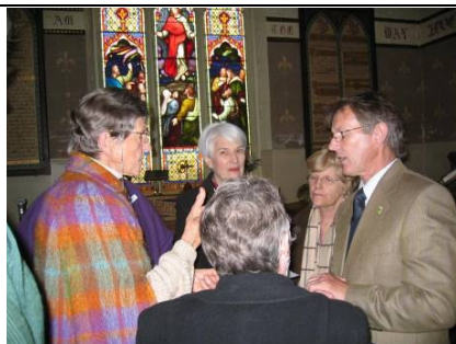
Discussing the plaque for Bong Bong