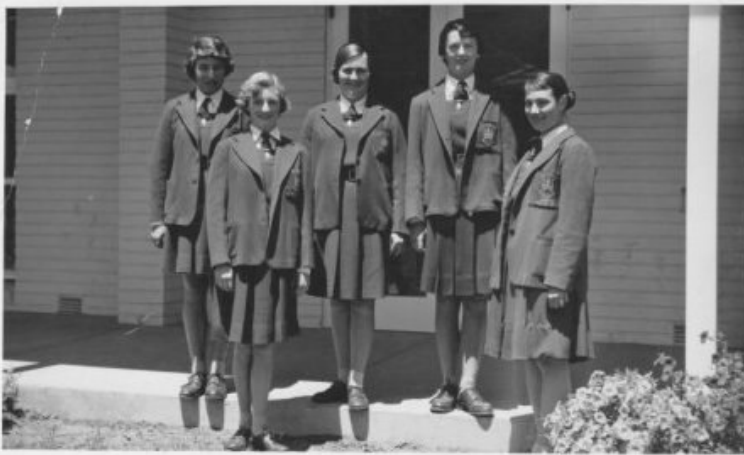
Top: Mistresses - 1957