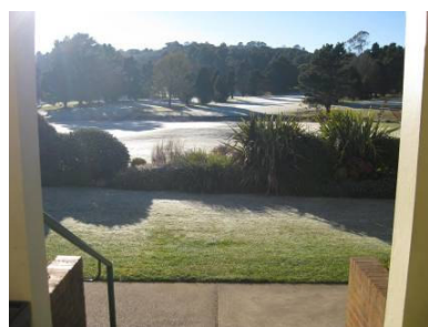
Lovely frost on golf course from Dormie